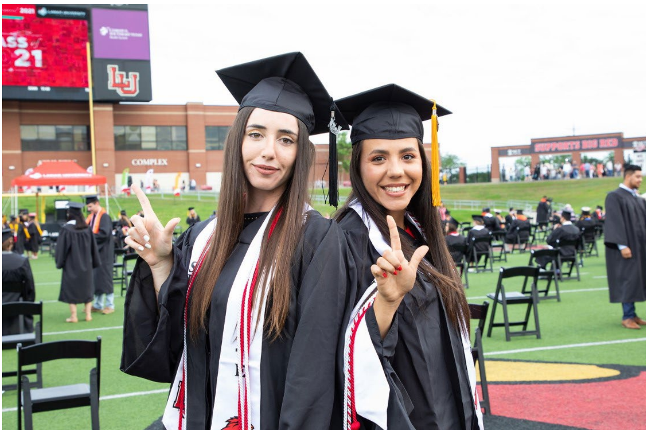
Latin Honors as of the 12th Class Day of Summer 2021