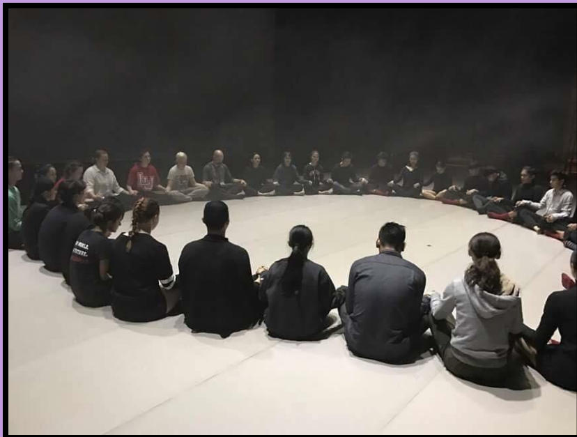
LU and TUT students prepare for a dance performance together in Taiwan during spring break 2017.

Probably the highlight for me overall was meeting the wonderful fellow dancers who we worked with in our performances. Learning and working so closely with the Taiwanese students created such a close bond – they have become some of my best friends. The local students showed us such incredible cultural moments and I am going to treasure all the adventures we had together. We visited beaches, museums, night markets, the zoo, and multiple malls and each time had a few of our local friends to guide us. The little bits of their language they could teach us before we left are still phrases my group continues to use back home in the U.S. Likewise, I know they are still using the phrases we taught them of English, like “that’s dope” and “check it out.” The language exchange created such a great memory. I still smile when I think about how we taught our friends to say “hi, I’m from Texas” with a southern accent!