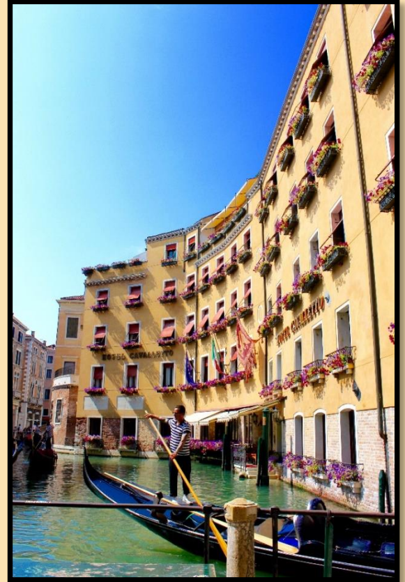
Students on the program visited the cities of Rome and Venice while living in Florence for a month.

Traveling abroad will expose you to many memorable, once in a lifetime experiences, and is really something everyone should participate in. Even though this particular study abroad program did not contribute directly to my academic or career goals, it was still a very enriching experience. Not everything you do in college has to be in your degree plan. College is one of the best times to branch out and learn about new things. Sometimes you don't need a specific reason to do something significant, such as studying abroad, outside of wanting to experience something unique and challenging. What's the point in living life – or attending college - if you're not going to take some time to enjoy it?