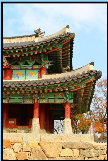
A traditional Korean building.

This past summer, I was given the wonderful opportunity to travel abroad to Daejeon, South Korea for the SSIS (Summer Session for International Students) program, hosted at Chungnam National University (CNU). This was the first time Lamar University sent students to CNU and also the first time I travelled abroad without my family. I felt like a study abroad pioneer and I knew I was in for an amazing experience.