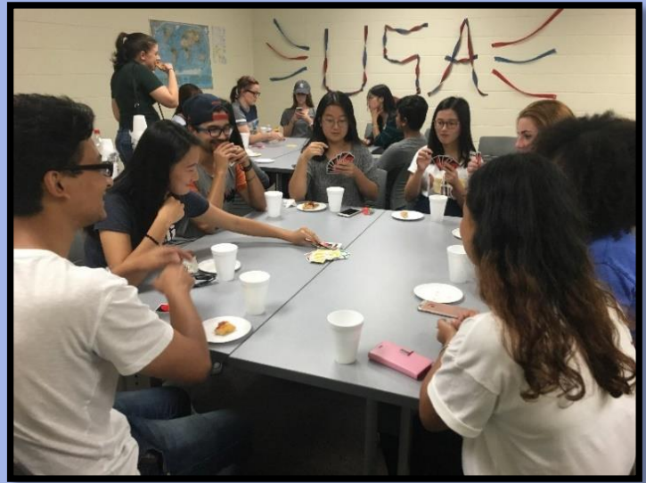
Cardinals Beyond Borders Pizza Party and Game Night

In the Fall 2016 semester, the Office of Study Abroad started a new program called Cardinals Beyond Borders (CBB). CBB matches students who have studied abroad with a “buddy” from another country. The purpose of this program is to help international students acclimate to American culture, and for study abroad students to make new friends while continuing to learn about the world outside of Texas.