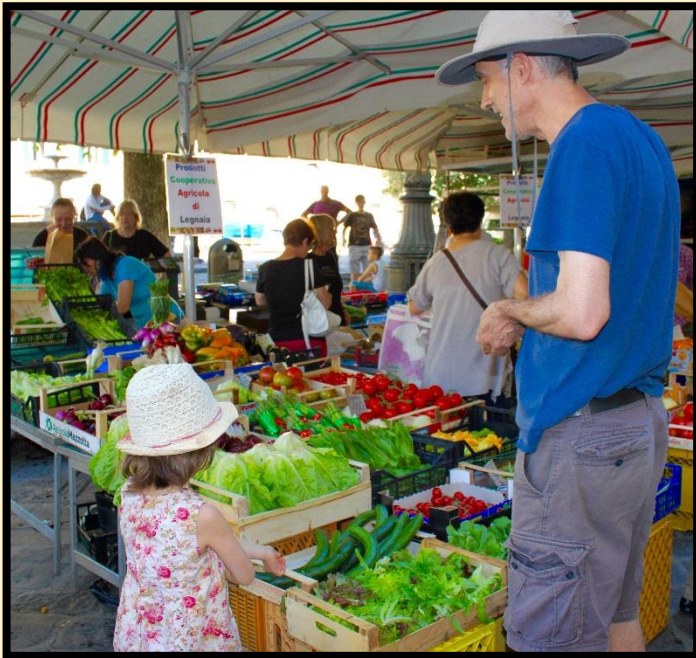
A man shops for fresh vegetables at a local Italian market.

One of the most educational parts of the trip was learning how to communicate with the local people. For the most part, the Italians we met were familiar with English and were able to communicate with us, especially in the larger cities such as Naples and Rome. But when we journeyed south to the region of Calabria, a part of Italy well off the typical tourist itinerary, we encountered a unique little communication challenge! Our group had a translator who helped us communicate with business owners and university students during class activities, but like all study abroad students should, my classmates and I took advantage of our free time to venture on our own to order food and shop at the local markets. Alas, despite our struggles with speaking Italian, we quickly