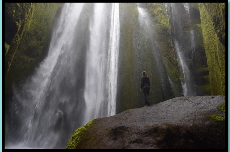
A waterfall located on the Seljalandfoss Hike.

The food, beauty of the landscape, and people I encountered were all amazing. But what I enjoyed most about studying abroad, aside from learning an abundant of information about the country I visited, was living like a local and taking advantage of our evening free time to explore the cities and towns where we were staying. By doing so I was able to meet many incredible college-aged students who would hang around town or were staying in the same hotel that we happened to be staying in.