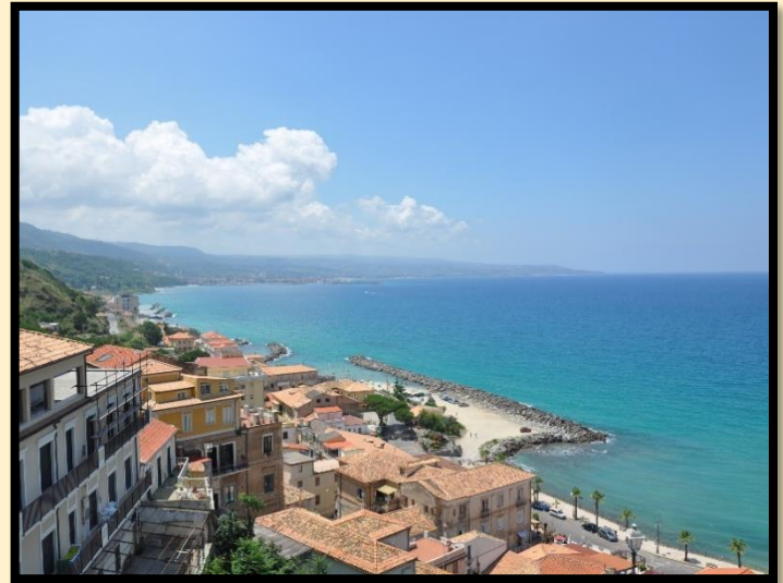
taken on the coast of southern Italy.

From walking up and down mountain villages to swimming in the Mediterranean Sea, my study abroad experience in Italy was an adventure that I will never forget. Every day was jammed packed with tours and exciting activities related to my Industrial and Organizational Psychology course, including long walks through beautiful historical towns and intimate interactions with local business owners. Despite my exhaustion and aching feet, being able to interact with the native people, eat the delicious food, and soak in the gorgeous scenery, made every moment of this journey life-changing.