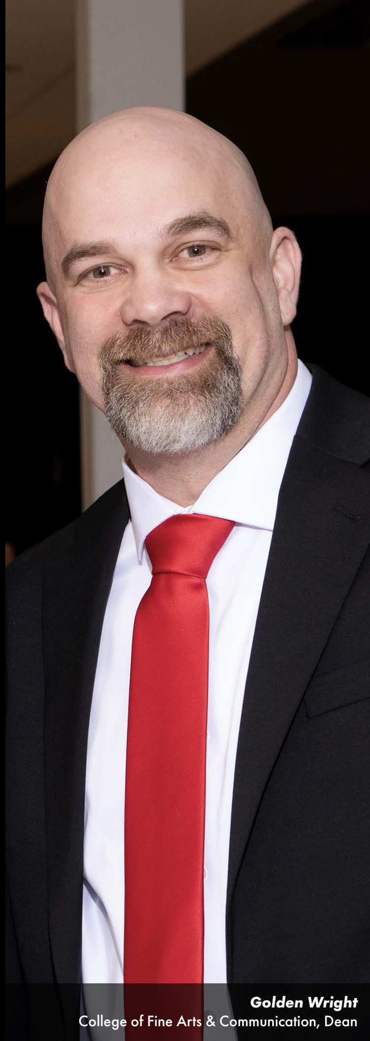
Golden Wright College of Fine Arts & Communication, Dean