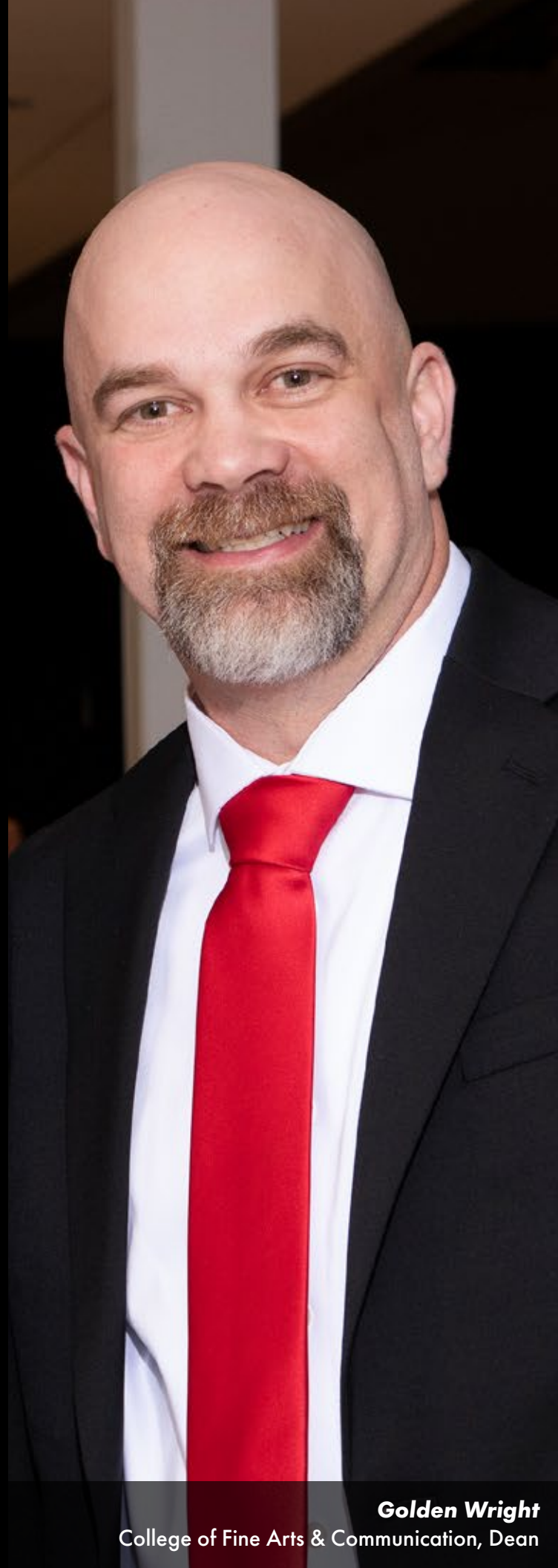
Golden Wright College of Fine Arts & Communication, Dean