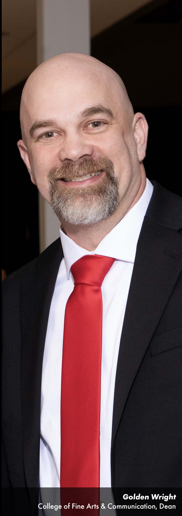
Golden Wright College of Fine Arts & Communication, Dean