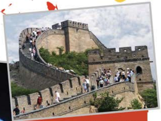
Beijing Great Wall

Take sociology classes in Summer I, 2014 with 2 weeks of study in Hong Kong, Macau, and China. Experience the exotic trip of a lifetime.