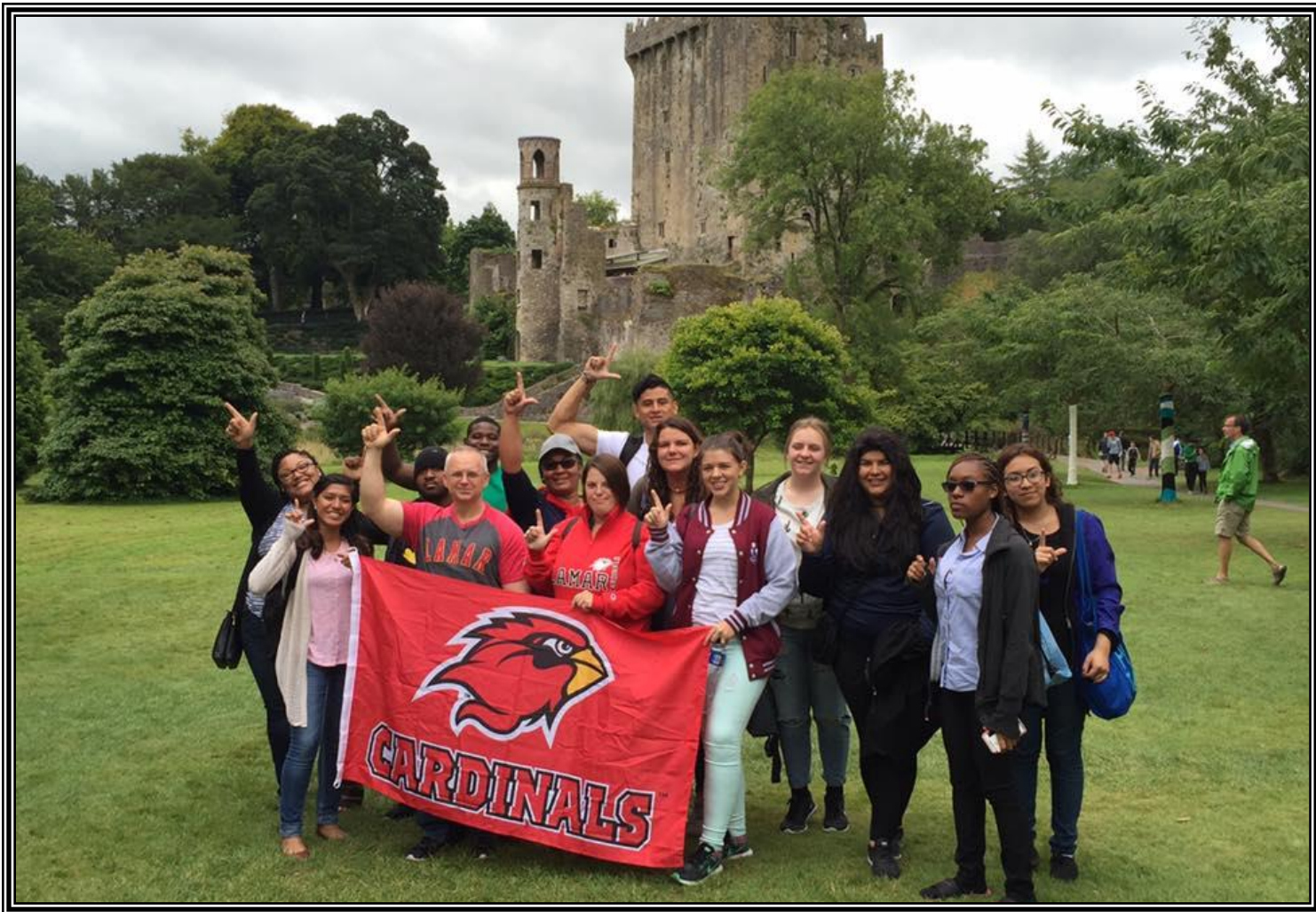
Criminal Justice students hold the Lamar flag at the Blarney Castle in Ireland.

years old. One of the more interesting historical sites visited by the team was the Blarney Castle where the students kissed the Blarney stone which as Irish legend goes, bestows the gift of gab. Allegedly, this gift of gab is so great that a person blessed with this gift could charm anyone into happily making choices to their own detriment. The students greatly enjoyed this. The Lamar study abroad group also attended the Gaelic Hurling match, a sporting event that has been around for thousands of years. "It was originally created to train the Irish to battle with axes against The Crown