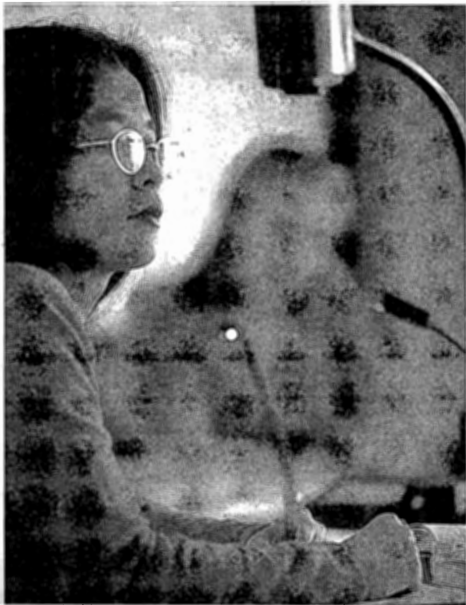
College of Business faculty and curricula equip students with skills that support problem-solving, teamwork and an entrepreneurial spirit.