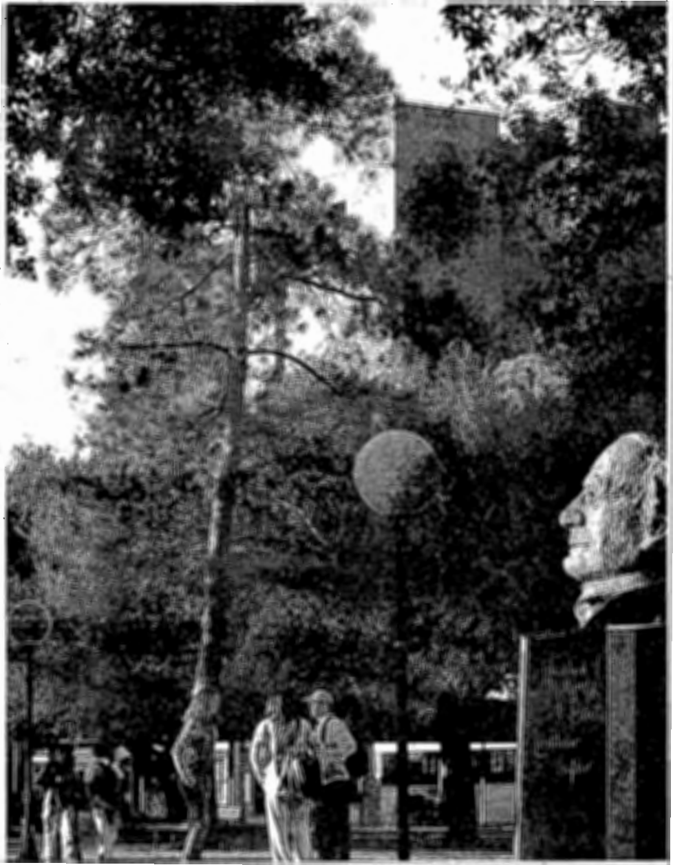
Surveyed by a larger-than-life bust of Mirabeau B. Lamar, the father of Texas education, students pause in the quadrangle, near the eight-story Mary and John Gray Library.