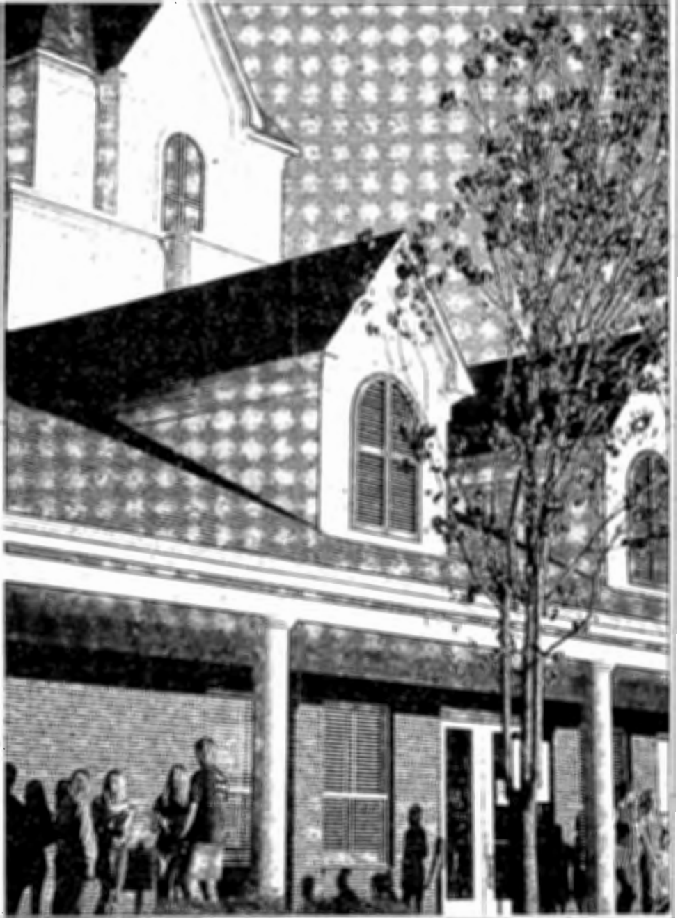
New residence halls provide a backdrop for a rich array of extracurricular activities — from intramural and NCAA Division I-A sports action to numerous organizational, Greek and performing arts opportunities.